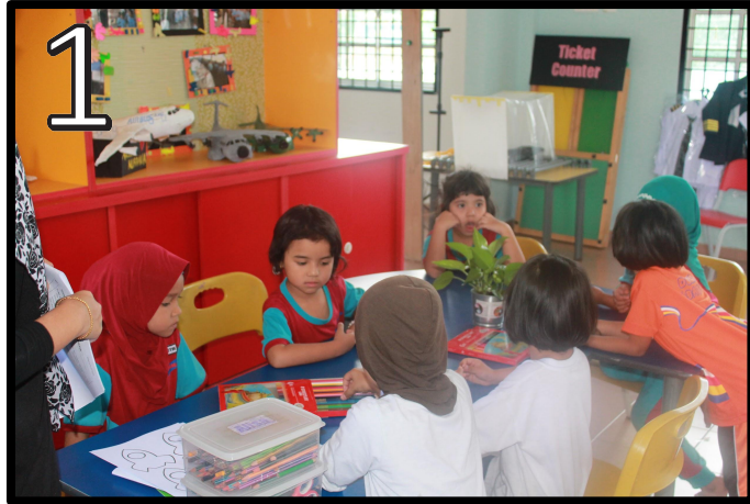
Children are divided into two groups